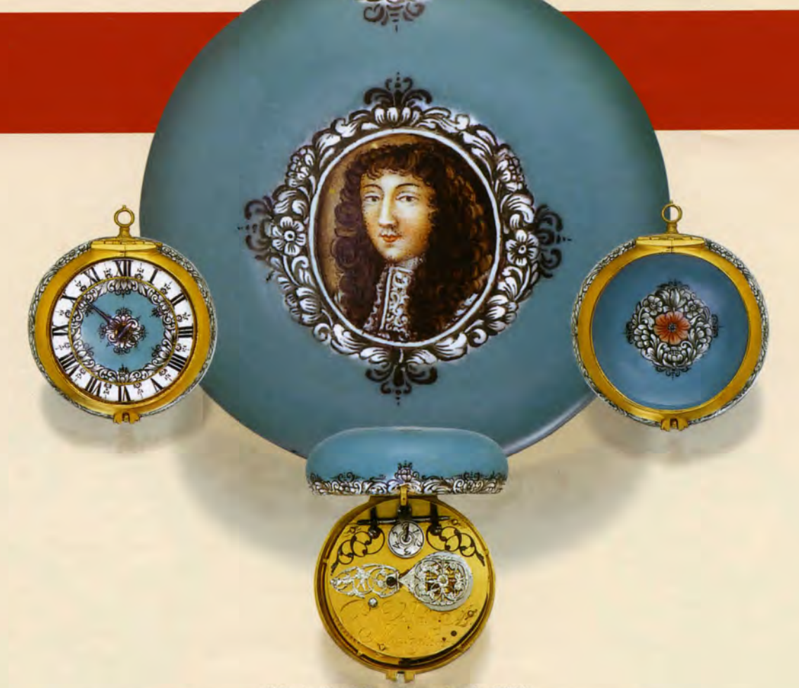
"Portrait of the Young Louis XIV" P(aul) Vallette à Montpellier, circa 1660, enamel attributable to Pierre I Huaud. 22K gold and enamel single-hand, pre-balance spring pendant watch with painted on enamel case. Sold at Antiquorum on April, 2002, lot 598, for SFr. 220,000 (US$ 147,000).