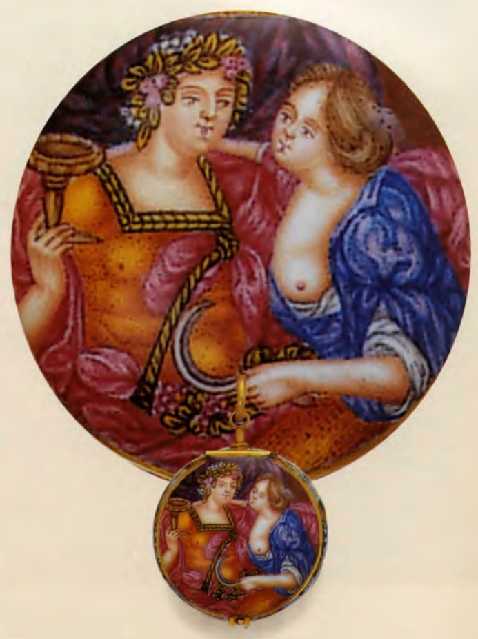
Abraham Cailliatte, Geneva, enamel attributed to Pierre Huaud l'ainé, Geneva, circa 1670. 22K gold and enamel pre-balance spring watch. Sold at Antiquorum on November 13, 1999, lot 5, for SFr. 110,000 (US$ 70,000).